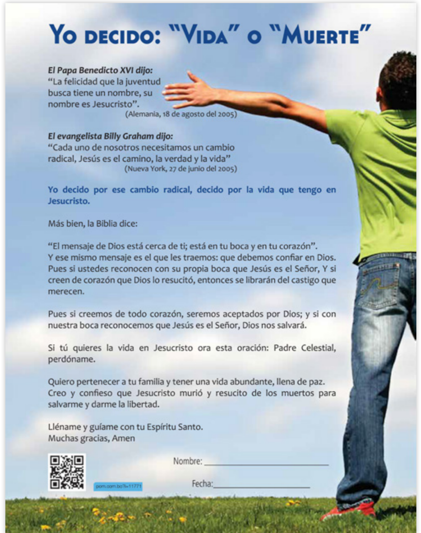
An example of the prayer of salvation in many of our textbooks.

Can you imagine being taught the Gospel by your public school teacher as part of a required school class?